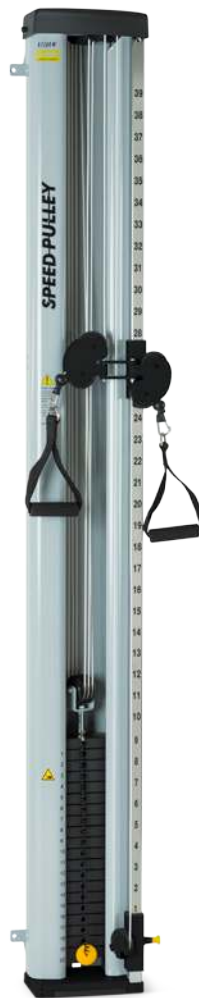
Speed pulley 50kg